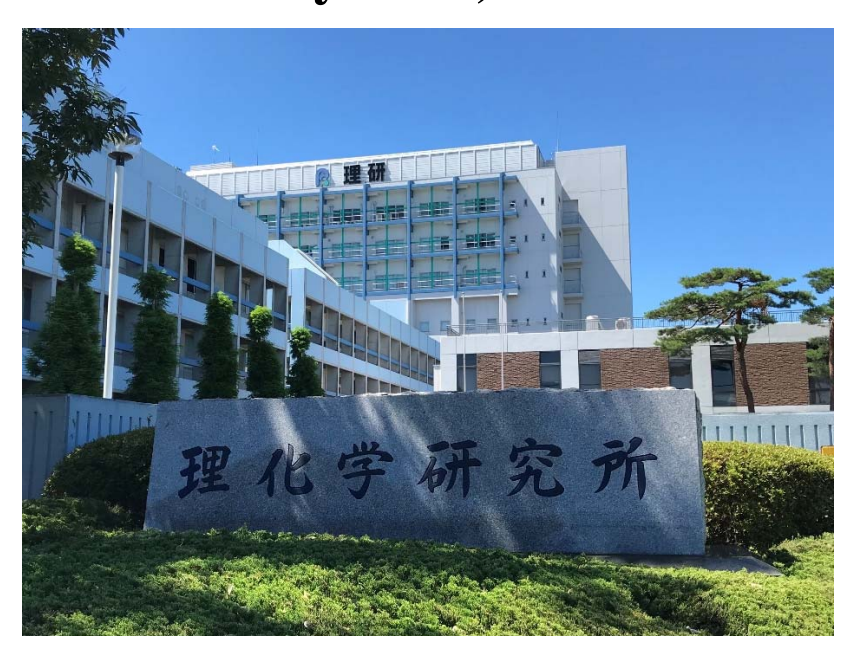
Foundation for Discoveries and Access to the Future